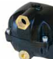
Sight port optionally available.