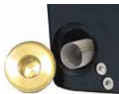
Integrated strainer to protect the valve