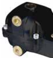
Three inlet options for easy installation.