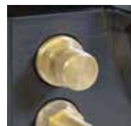
TEST button feature for routine testing.